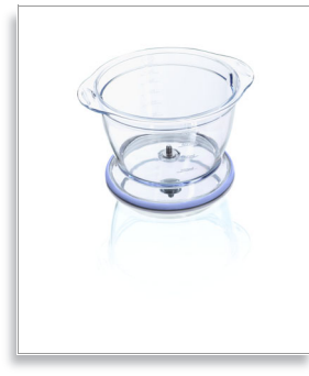
Large 1 L plastic bowl