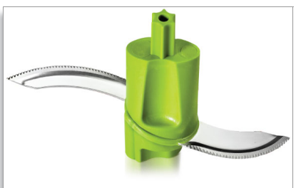
Serrated blade chops molokhia leafs