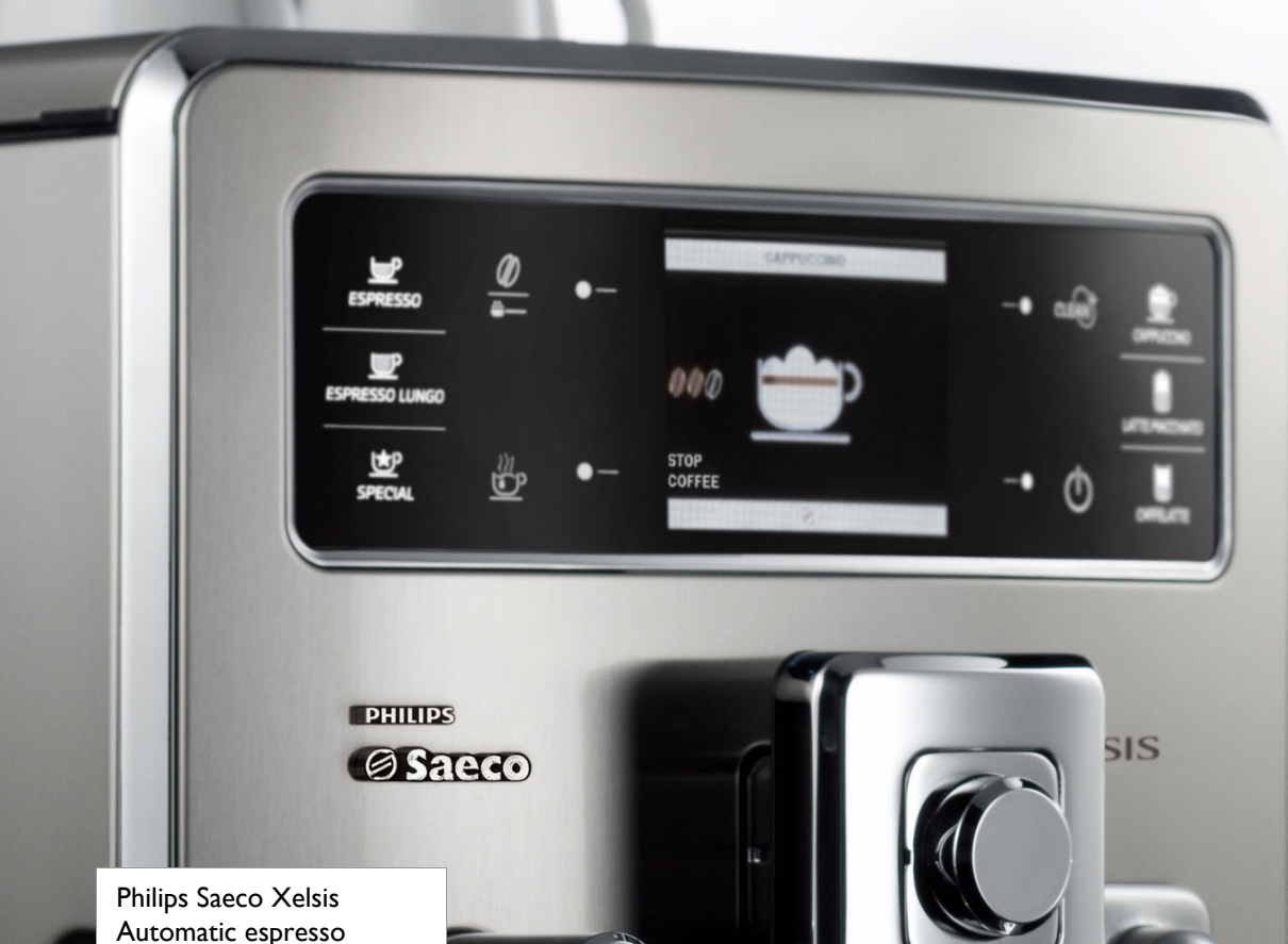
Philips Saeco Xelsis Automatic espresso machine