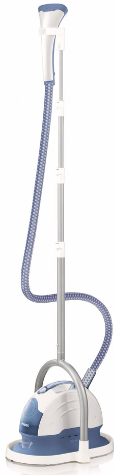
Philips QuickTouch Garment Steamer