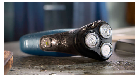
Rinse under running water or shave in the shower. The IPX7 waterproofness rating means it can be submerged in one meter of water for up to 30 minutes.