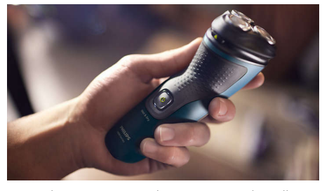
Never lose your grip. The ergonomic handle with rubber stays secure and comfortable, even when wet.