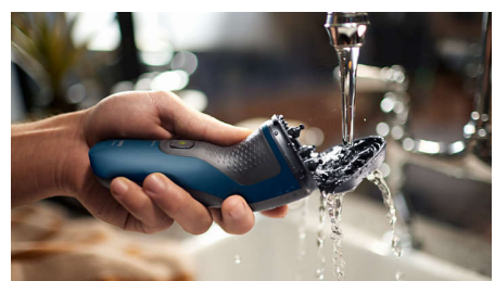
The shaver head flips open at the touch of a button to rinse clean under running water.