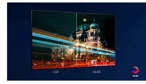
With a Philips OLED TV, you get a wider viewing angle and a uniquely lifelike picture. Blacks are deeper. Colors are truer. Details in shadows and highlights are precisely

reproduced. All major HDR formats are supported. You'll feel the full power of every scene.