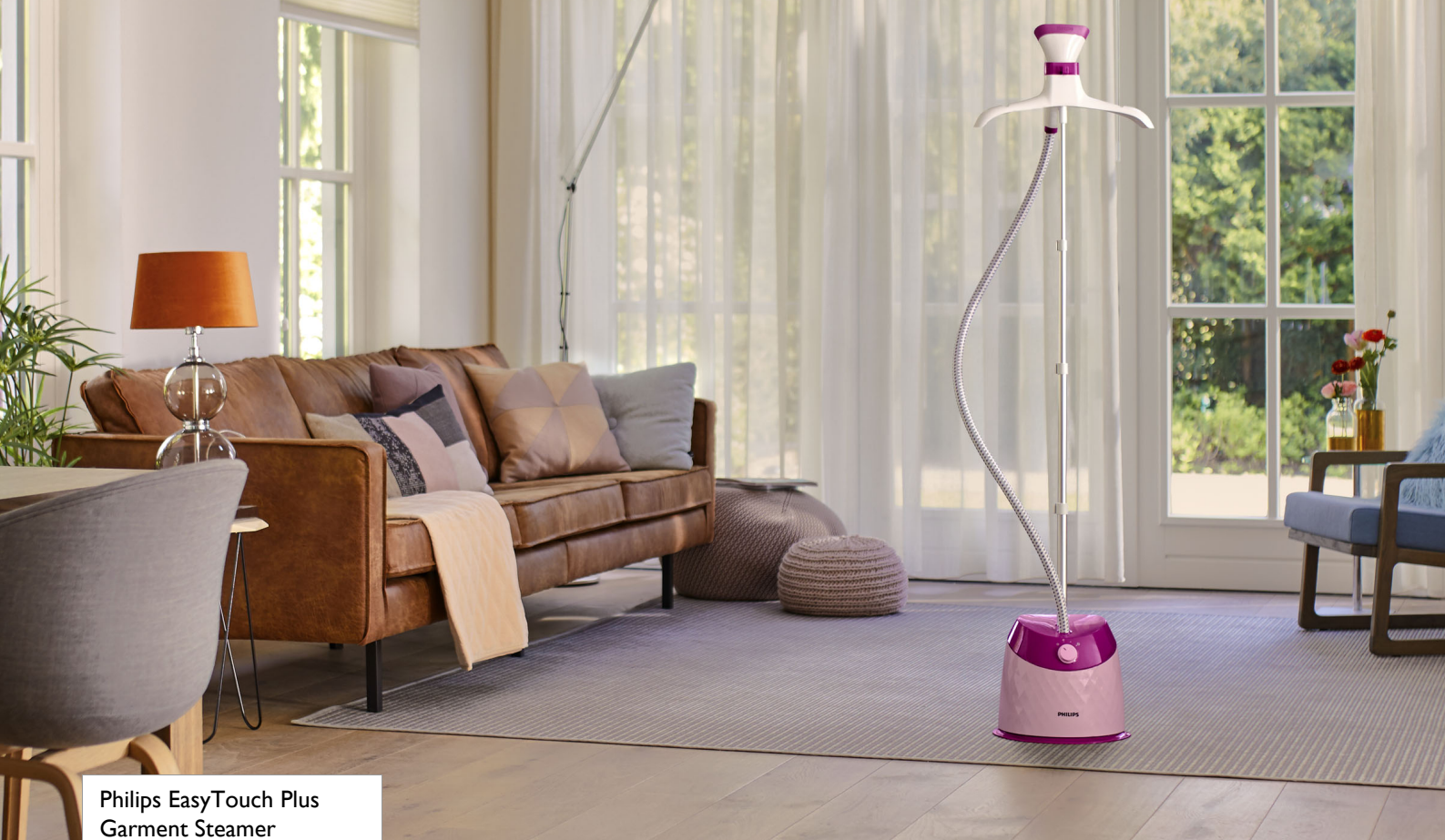
Philips EasyTouch Plus Garment Steamer