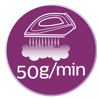
Steam up to 50 g/min

Continuous steam output of up to 50 g/min gives you the perfect amount of steam to efficiently remove all creases.