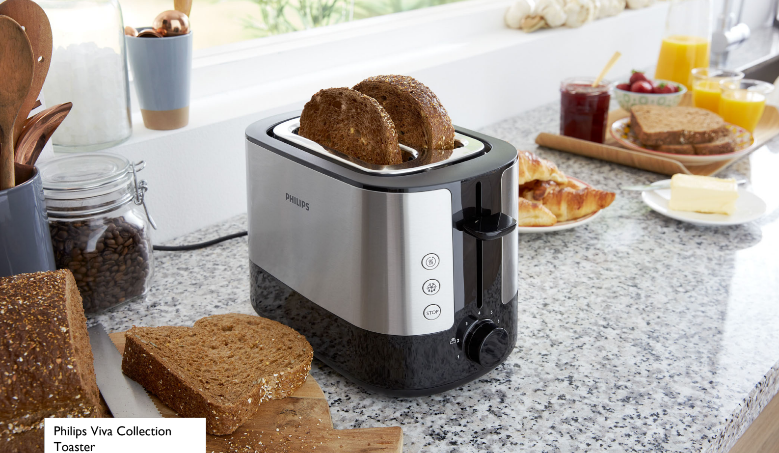
Philips Viva Collection Toaster

Extra wide 2 slots toaster Built in bun warmer Black