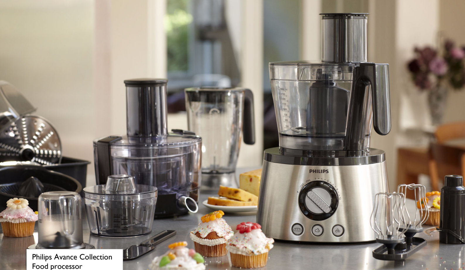
Philips Avance Collection Food processor